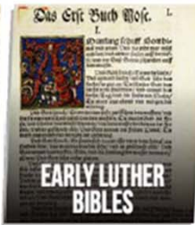
EARLY LUTHER BIBLES